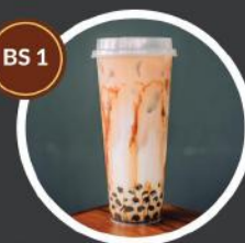
Brown Sugar Pearl Signature Milk Tea