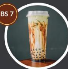
Brown Sugar Pearl Matcha