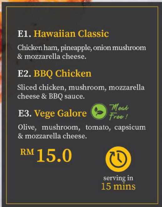
E3 Vege Galore