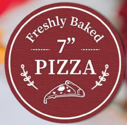
E1 Hawaiian Classic